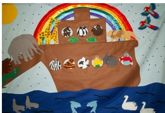
Children designed banners based Noah's Ark

As a C of E School Religious Education is an important part of our school curriculum. We follow the Cornwall County Agreed Syllabus 2014 for RE in line with the Diocesan Guidelines. This ensures Christianity is covered in depth whilst also studying other religions such as Hinduism, Judaism, Islam and Sikhism. As a Church of England School our pupils are taught about religions and how to learn from religions. They explore faith and belief and its implications for living but are not told what belief they should follow.