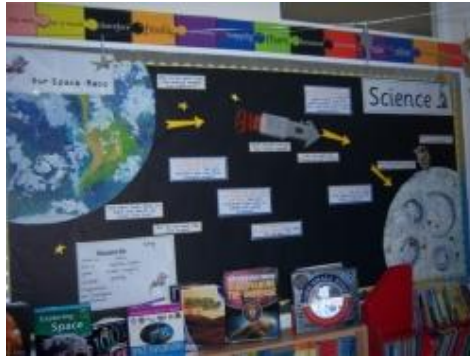
Class 6 Space Display