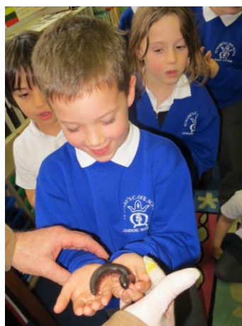
Children learning about Mini beasts with a visitor to the school