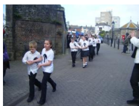
Dancing in the St.Piran's Day Parade in Penzance

We also have a Language of the year that teaches all children one of our community languages and promotes understanding of the country and culture of that country.