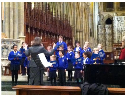
Our school choir singing in Truro cathedral Christmas 2013

Various clubs are run at lunch time and after school including: construction,, football (we hope to start this again in 2015/16), Heart-start, tag rugby, high 5/netball, multisports, tennis, Jump Dance, cooking, gardening, choir, recorders, ukulele. art and film club. Others may be run for short periods e.g. school band, Dangerous club, Goblin car building club.