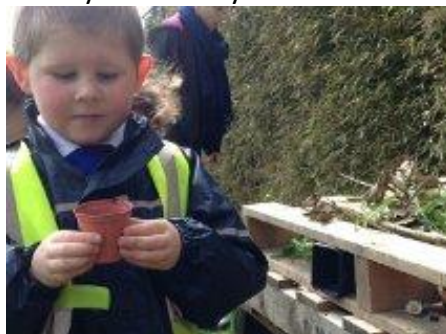
Finding out about growing in reception class.

If your child attends our pre-school he/she will already be familiar with the staff and Foundation stage environment and routines, however some children come from other settings and we aim to ensure that all children have a successful start to their first year of school. During the summer term before the children begin reception class, parents and children will be invited for transition visits into reception class. The aim of these sessions is to ensure the children become familiar with the physical space and adults in the main school. By doing this we find that the children excited, ready for their start in main school whilst also feeling secure about surroundings and new people. The result of this is that the children settle quickly into the new routines in September when they start in reception class. We also have an induction session for new parents to ensure that you are fully informed about school life at St. Mary's.