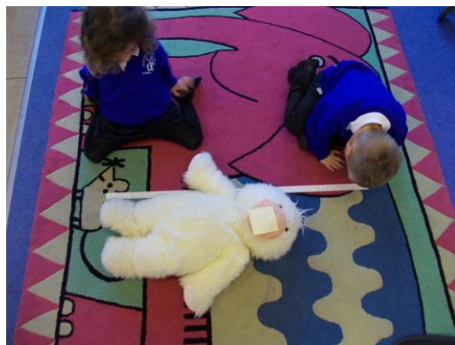
Learning about measures in Reception class

At St. Mary's children in our reception class are an integral part of our school and there are strong links between reception class and the rest of the school. This includes our Buddy scheme with class 6 (year 6) to ensure all children feel welcomed and included at playtime. Our playtime leaders (year 5 and 6 children) help organise activities for younger children. Working in this way builds a real sense of community across our school. Reception class children also attend assemblies so they feel part of the whole school community.