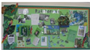
Class 3 Home-Learning Projects on The Rainforest

This is an open ended piece of work and parents are welcome to assist their child. The purpose of this is to encourage the child to talk about their learning in school. We have received some fantastic and innovative projects from pupils. We have moved this to the start of the project now so the children generate ideas for further learning during the project. This will also include topic specific vocabulary so learning this at the start is very beneficial.