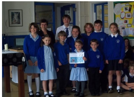
The school council receiving their award in 2011.

We now have a School's Council consisting of elected members from each class (except Class 1) The Council meet regularly each term and take discussions back into the classrooms. The School Council achieved a Platinum Award in 2008 and were re –accredited with Platinum in May 2011. We are planning to follow this reward scheme again in 2015.