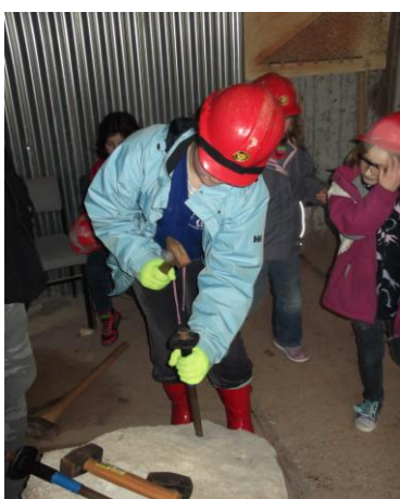
Working hard at Geevor mine