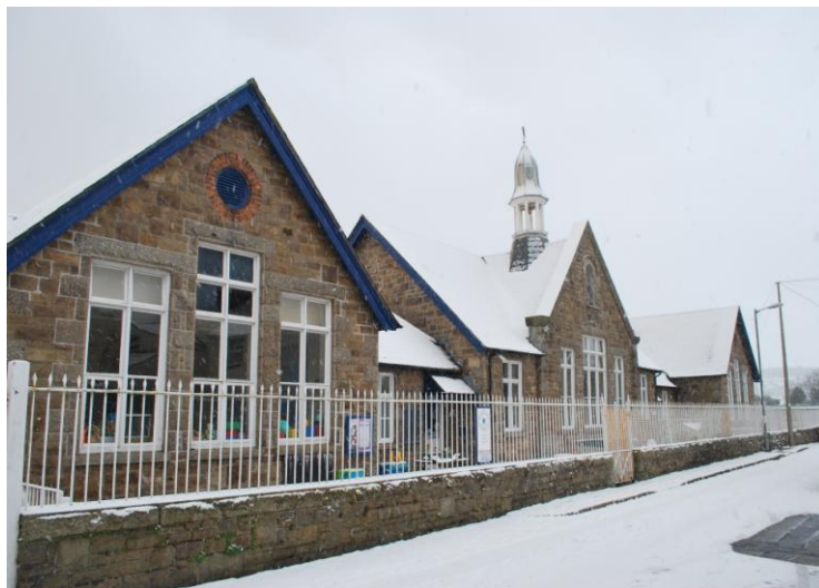
St Mary's in the snow –December 2010